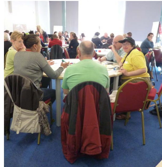
Discussions taking place between service users, professionals and service providers at World Mental Health Day